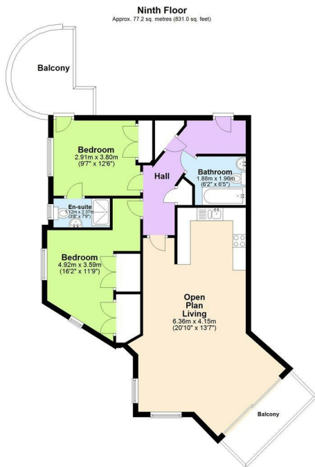
Total area: approx. 77.2 sq. metres (831.0 sq. feet)